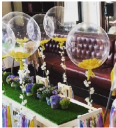
Table Centrepieces & Clear Confetti Balloons

Also available: Giant Balloon Ceiling, Bespoke and Branded Balloons, Foil Letters and Numbers. Please speak to your Event Coordinator for a quote.