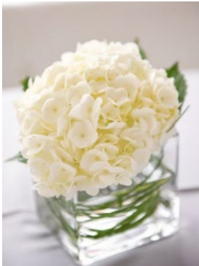
Table centrepieces start from £35.00+VAT each but the possibilities are endless, so do speak with your event planner for recommendations.

The team of highly experienced designers are masters of their art, and will combine their knowledge and attention to detail to produce the highest quality floristry to suit all styles and budgets.