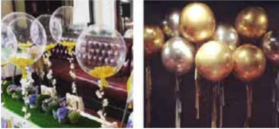
Table Centrepieces & Clear Confetti Balloons

Personalised balloons and logos available at £5 per balloon £82.50 Delivery & Set Up